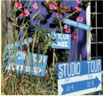
Look for the blue and white Studio Tour signs!

This year the tour is happening on two separate weekends, July 16–17 and August 20–21, and includes 74 exhibiting artists. It's a self-guided tour that takes you across small highways and rural byways. Along the way you'll discover artists working in different mediums, such as oil, acrylic, watercolor, photography, sculpture, basketry, textiles, shells, ceramics, glass, wood, paper, jewelry and recycled materials. All you have to do is follow the map and look for blue and white "Open Studio" signs and the windsocks that mark each location.